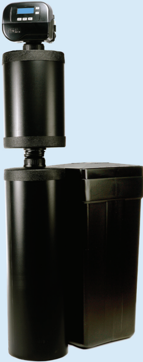
SmartChoice™ Gen II Stack Tank System with 15" x 17" x 36" brine tank

The SmartChoice™ Gen II Stack Tank Systems are designed to deal with moderate problem water such as chlorine, chloramines, light sulfur, moderate iron/iron bacteria, and/or heavy metals. The stack tank is designed for the softener resin to be contained in the bottom tank, whereas the top tank has the specialized filter media. This allows for the water to flow through the filter media first, which pre-treats it before it is softened.