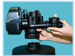
SmartChoice™ Gen II Control Valve Easy Disconnect